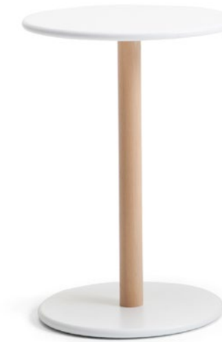
Common D45 H55 white finish