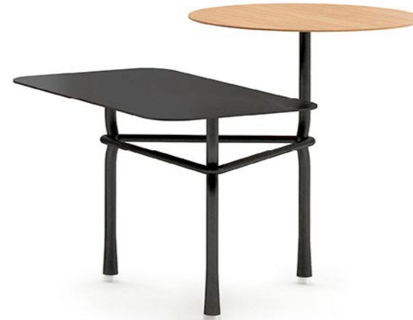
Tiers A black structure | rectangular top in black, circular top in matt oak