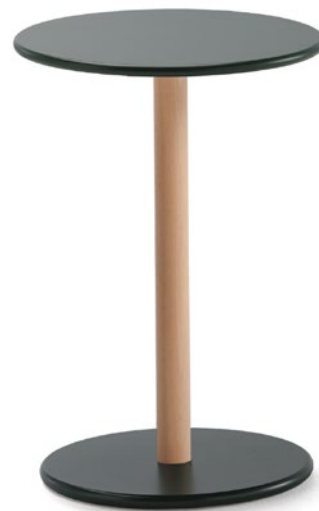
Common D45 H55 black finish