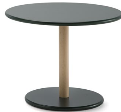
Common D60 H45 black finish