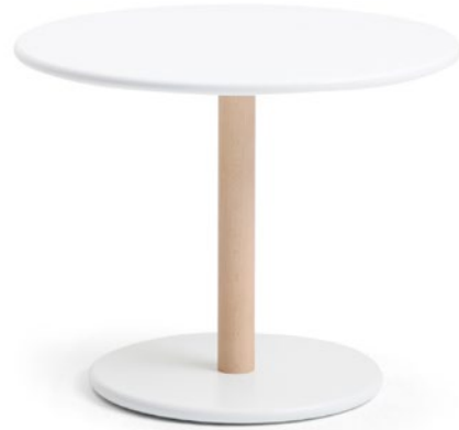
Common D60 H45 white finish